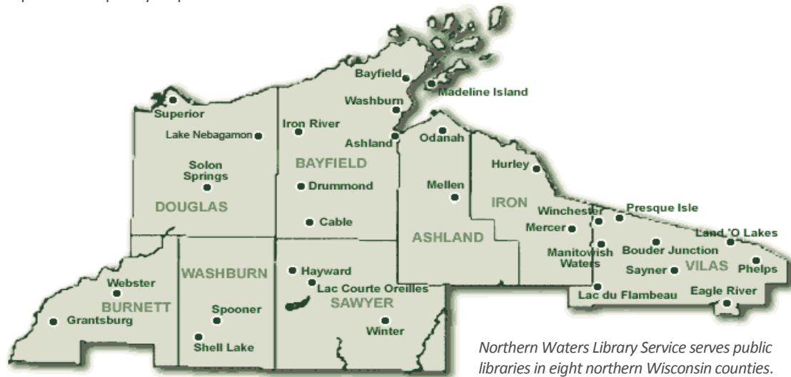
Northern Waters Library Service serves public libraries in eight northern Wisconsin counties.

Northern Waters together with community libraries is dedicated to providing high quality public library service: